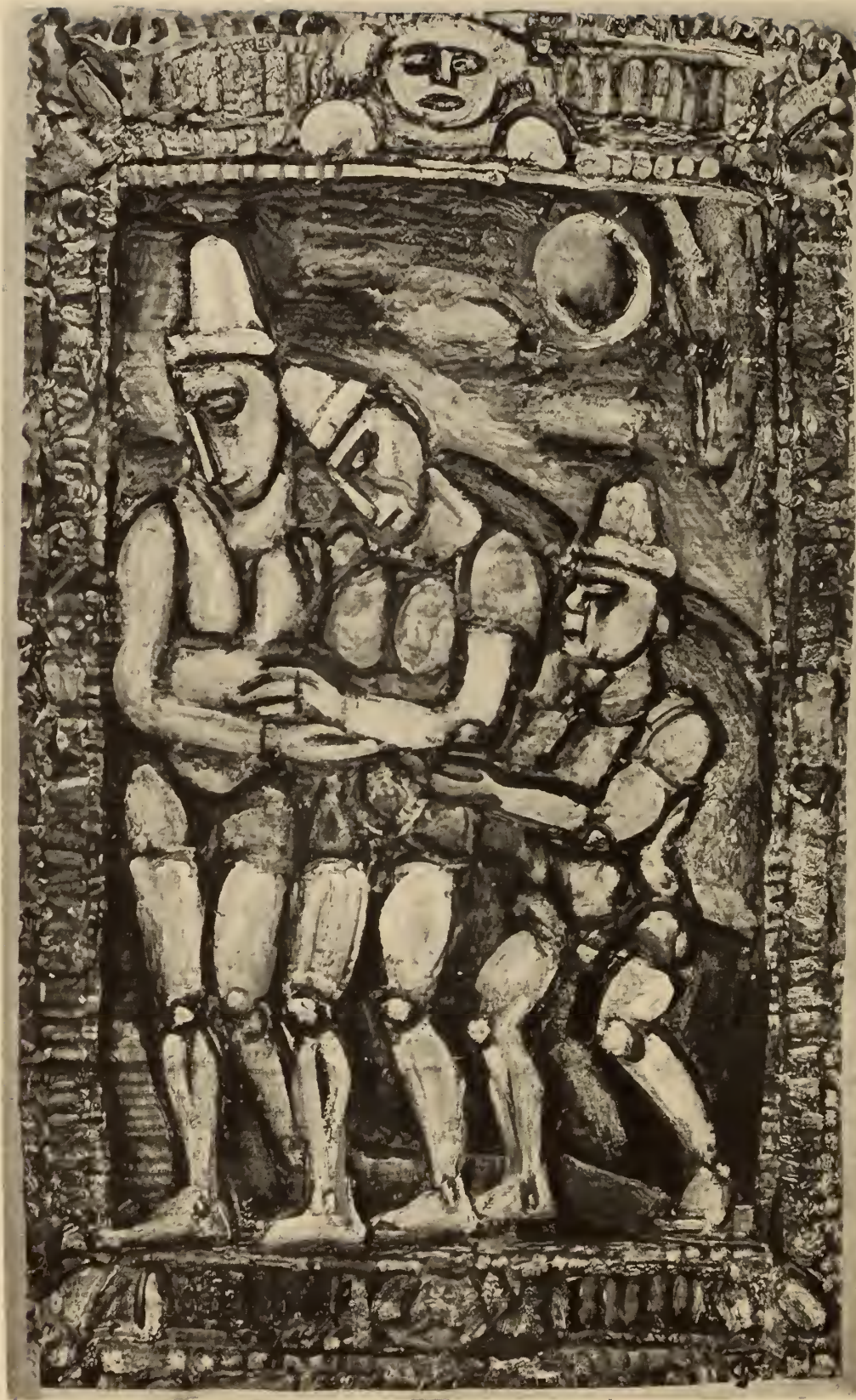
GEORGES ROUAULT — "Sorrow"